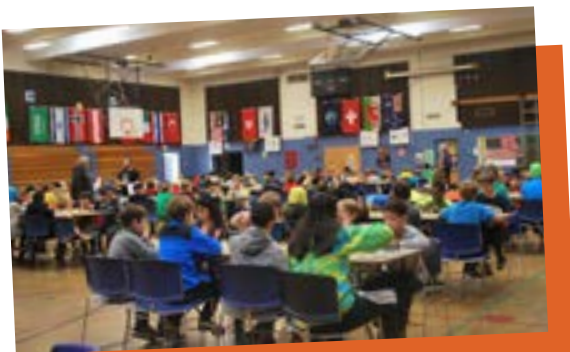
Total of 176 students Competed!